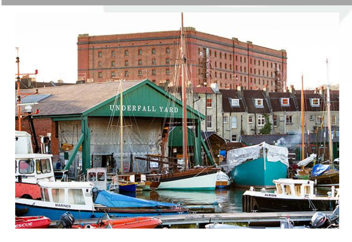
Underfall Yard in Bristol is an exemplar project, showing how a heritage facility can make a major contribution to economic revival. Traditional skills are allied with an intriguing and popular tourist destination.

The Exeter Heritage Harbour Route Map will lead to a sea-change in perceptions of, and connections with, the water for Exeter's residents and visitors through thi renewal of maritime life on the canal and basin. Not just a Heritage Harbour—a Heritage Harbour for today and tomorrow.