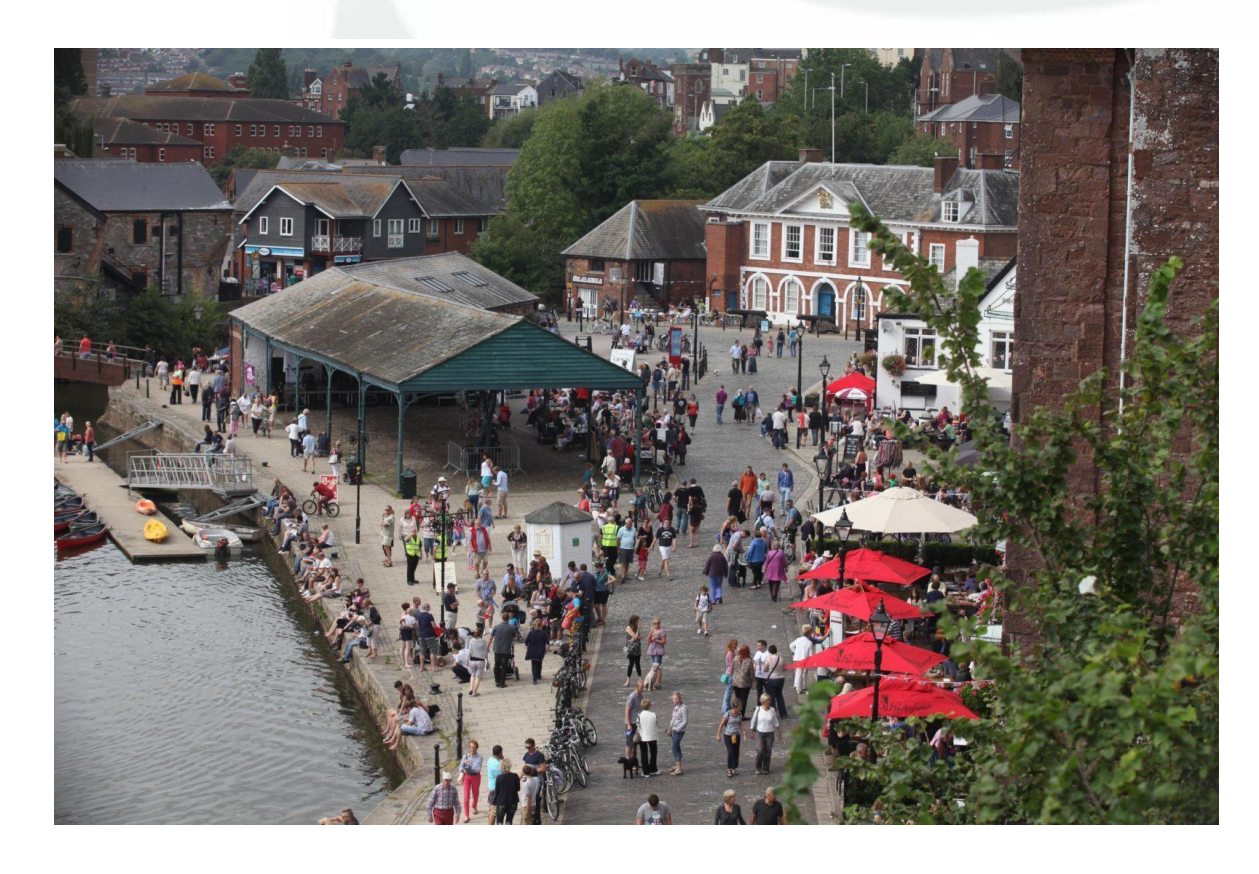
Exeter Quay - an increasingly popular destination, but with the potential for so much more, both within the city and along the canal.